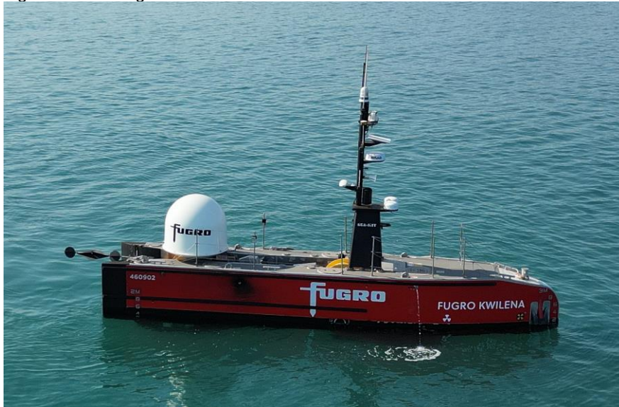
Figure 2: USV Fugro Kwilena

AUS Charts and Publications Affected: AUS357, AU438148